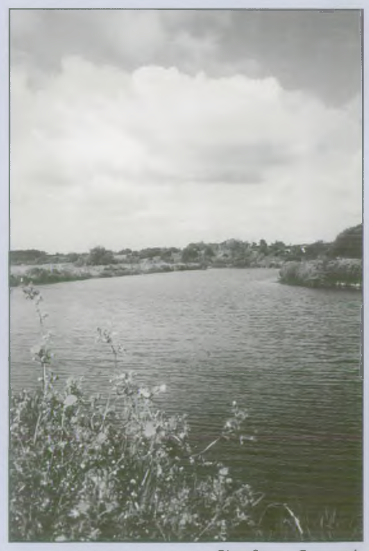
River Stour - Cattawade