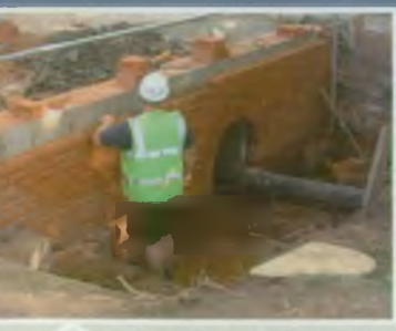
▲ New culvert on Village Stream