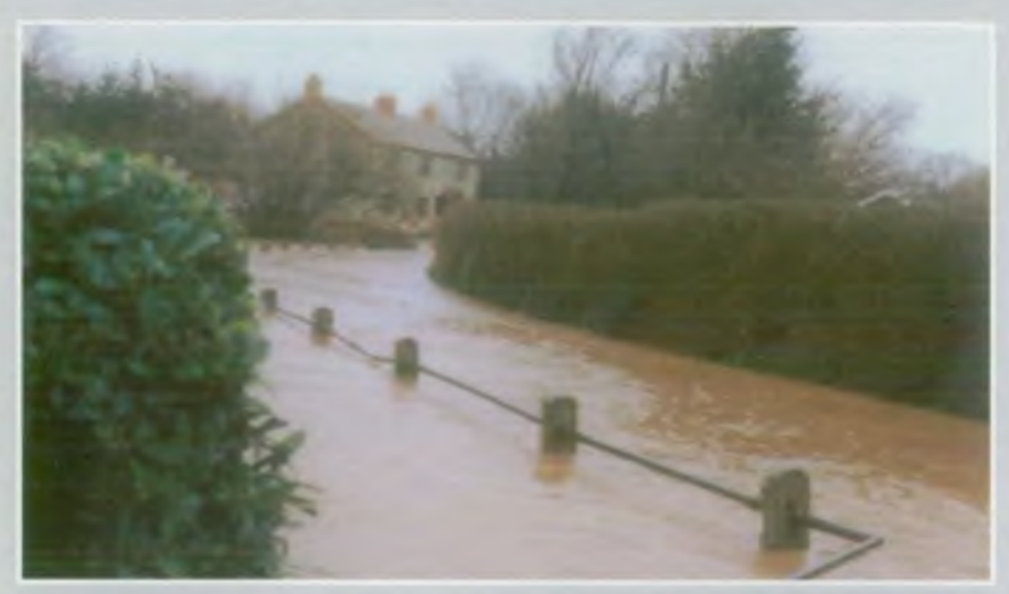
▲ The village in flood