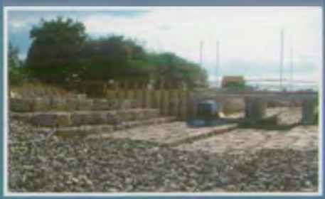
New rood bridge under construction