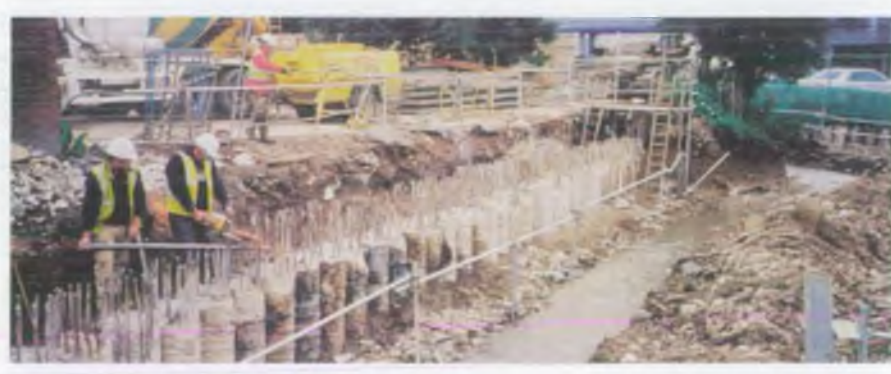
Work in progress during Phase 1