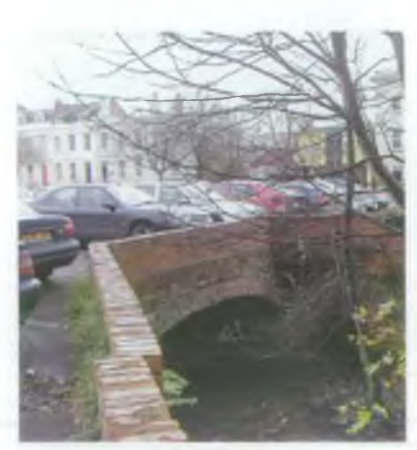
Rodney Road car park, which may be temporarily affected by the works