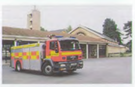
Cheltenham Fire Station headquarters