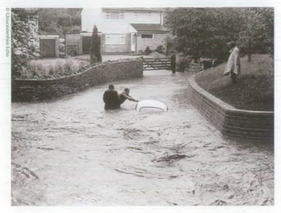
A car submerged in a flooded River Chelt at the ford in School Lane, Charlton Kings, 1979