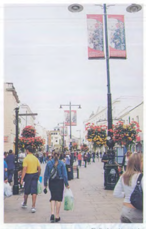
Cheltenham town centre

The original river valley has been heavily developed with housing estates, public buildings and industrial sites.