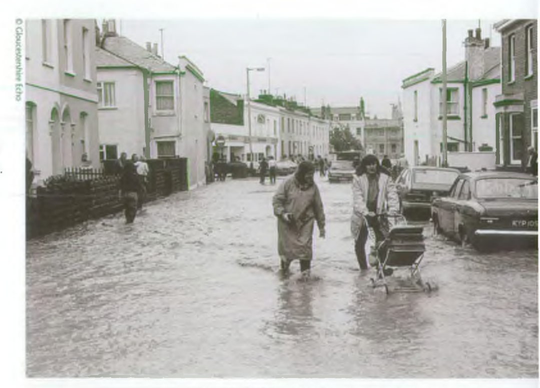
A family struggle through a flooded street in Cheltenham, 1979

* Floods are categorised by their size and frequency with which they can be expected to occur. A 1 in 5 year flood is one that has a 20% chance of happening in any year – this is a relatively minor flood. A 1 in 100 year flood has only a 1% chance of happening in any one year, but its effects can be enormous.