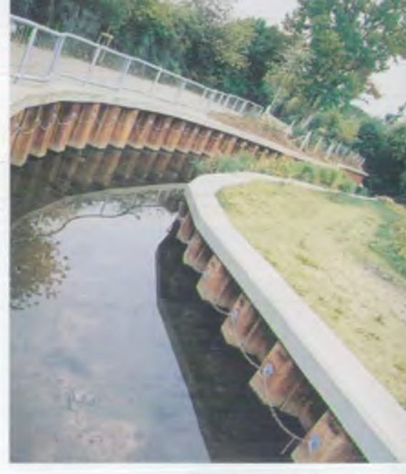
Phase 1 at Arle Park