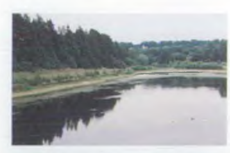
Dowdeswell Water will work in tandern with the part-time storage area at Cox's Meadow