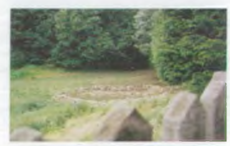
Crayfish pool at Dowdeswell Water