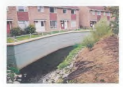
Kierle Walk, downstream of Princess Elizabeth Way

Initial works extended from the Bristol–Birmingham railway line to the downstream outskirts of the town and involved construction of an additional culvert under Princess Elizabeth Way, reconstruction of six bridges, channel improvement works and floodwalls. This was completed in 2002.