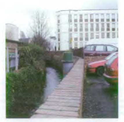
The culvert under Bath Road car park will be replaced with a wider one