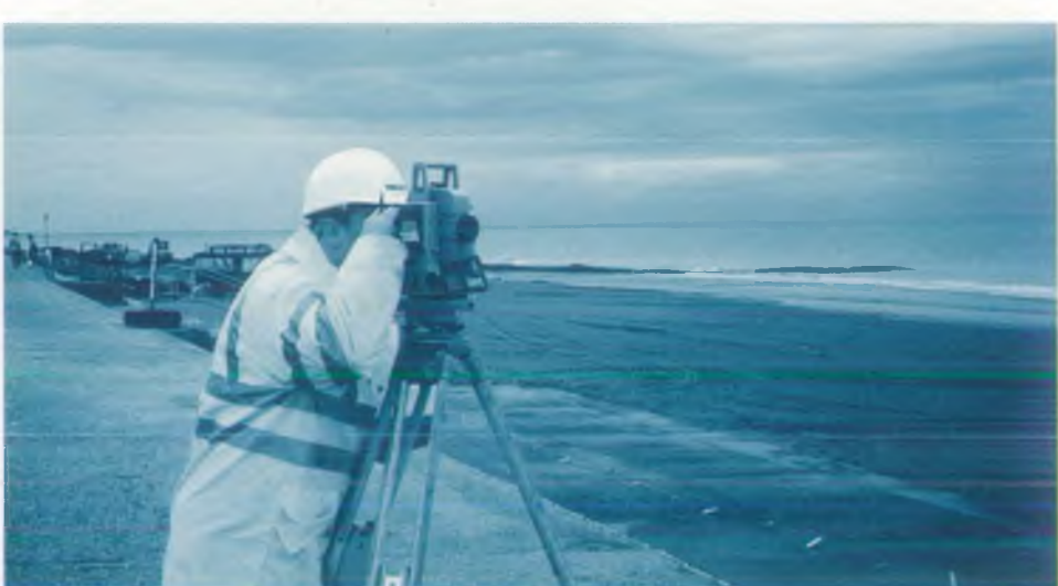
Right and below: Topographic Survey work.