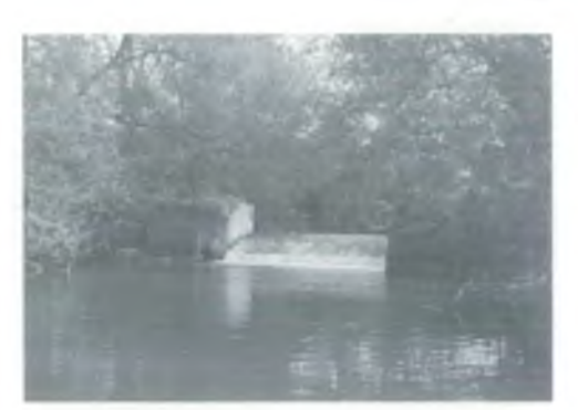
Weir at Nantwich.

Maintenance works are constantly carried out by the NRA's Flood Defence staff in the never-ending battle against flooding. Control of river bank vegetation and the removal of debris and silt deposits from the river bed and banks help to prevent localised flooding during high river flows.