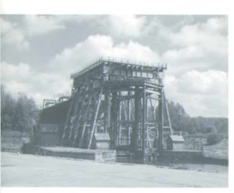
The Anderton Boat Lift.