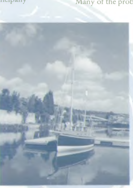
Boats at Northwich Marine, Weaver Navigation.

through the use of a system of water abstraction licensing. As a legal requirement under the Water Resources Act 1991, almost anyone who wants to take water from a surface or underground source must obtain a licence to do so from the NRA. Without this constraint, persistent over-abstraction could lead to shortages in water supply, increased river pollution by reducing dilution of pollutants, damage to fisheries and wildlife habitats and, ultimately, to the loss of rivers for our recreation and enjoyment.