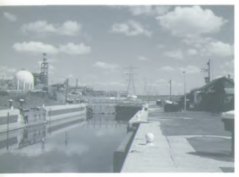
Weaver Navigation meets the Ship Canal.