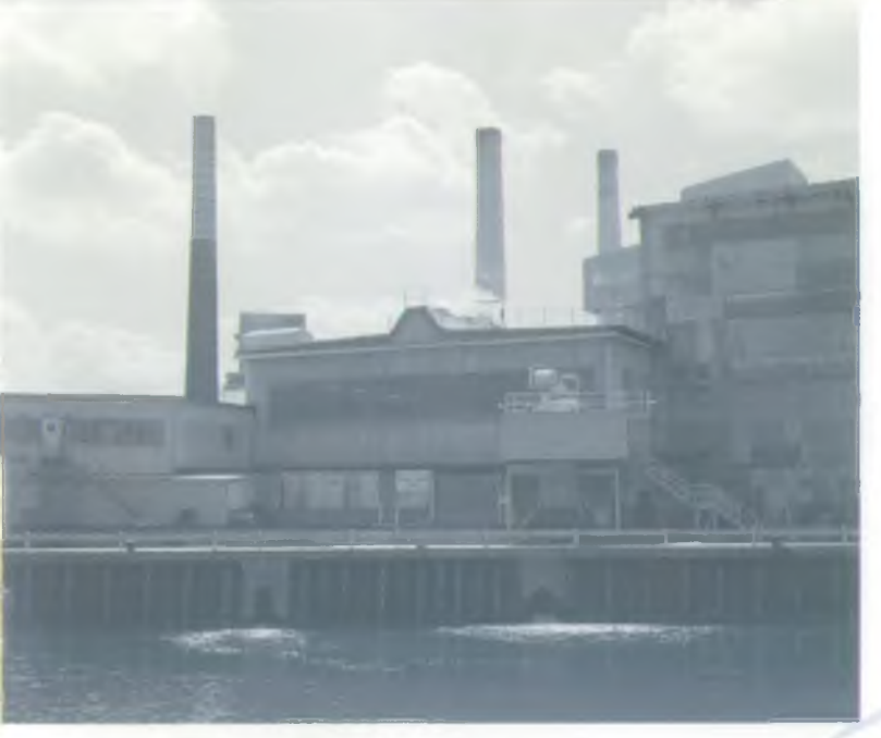
Chemical Industry at Northwich.

The main industry in this part of the country has, historically, been salt. The modern importance of Cheshire salt is that it now forms the basis of the area's chemical industry.