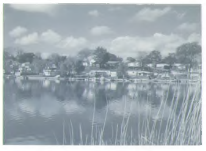
Holiday Park at Bottom Flash, Winsford.