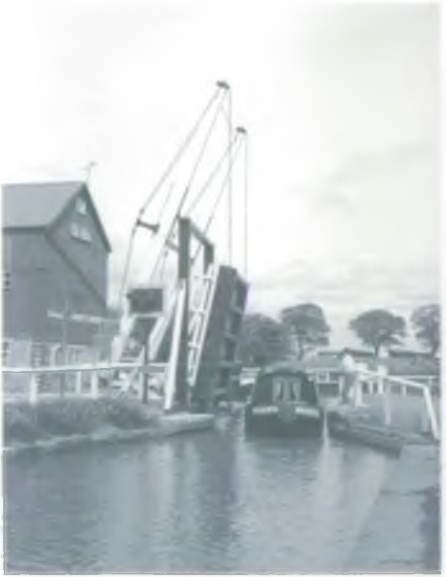
Llangollen Canal lift bridge, close to the source of the River Weaver.

One major role of the NRA in protecting and improving water quality is issuing 'consents' permission to discharge effluent within certain limits imposed by the authority. Such limits are imposed on industrial discharges and sewage works alike. NRA staff constantly monitor discharges and can review the conditions of each consent every two years. If the consent limits are exceeded, the NRA can prosecute the offender. The NRA can also prosecute for one-off spillages or any discharges without consent.