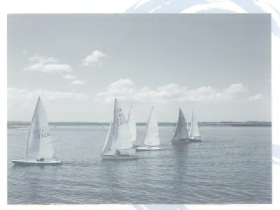
Sailing at Marsh Lock where the Weaver meets the Ship Canal.

groundwater suitable for small scale use. These 'minor aquifers' can also contribute baseflow to rivers where they have been cut by the watercourse.