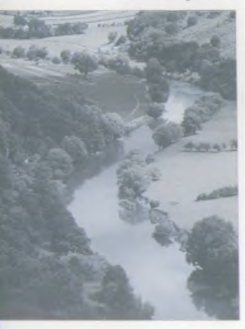
The Wye Valley

The NRA believes that it can only carry out it's work by adopting the concept of integrated catchment management. This means that a river catchment is considered as a whole and the actions in each of the NRA areas of responsibility must take account of the possible impact on other areas.