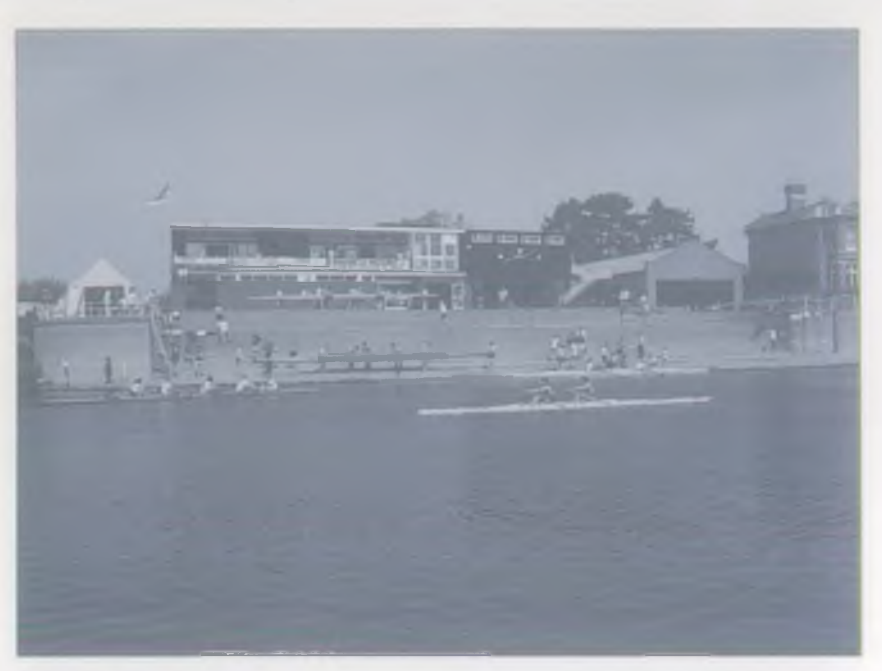
Rowing on the Wye at Hereford