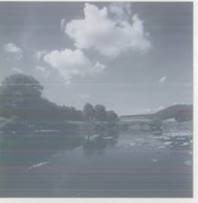
River Wye at Redbrook

Groundwater is important in the catchment particularly around Chepstow and