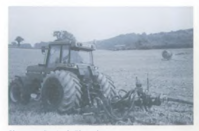
Slurry spreading in the Ely catchment

Sludge from sewage and industrial sources is applied to agricultural land in the catchment. The disposal of these wastes are covered by the 1994 Waste Management Licensing Regulations. However, wastes other than sewage sludge, that are deemed to be beneficial to the land, based on " properly qualified advice", subject to specified maximum quantities, are exempt from waste disposal licensing. The disposal of sewage sludge from municipal sewage works is subject to the statutory provisions within the Sludge (Use in Agriculture) Regulations 1989 and is monitored by Her Majesty's Inspectorate of Pollution. As sludges are a potential source of contamination of ground and surface water, the NRA encourages notification by waste disposal contractors so that guidance can be given on how to avoid detrimental effects on the water environment. The NRA is also in the process of drawing up a guidance document in conjunction with the National Association of Waste Regulation Officers to give further guidance on responsibilities in the sludge disposal activities.