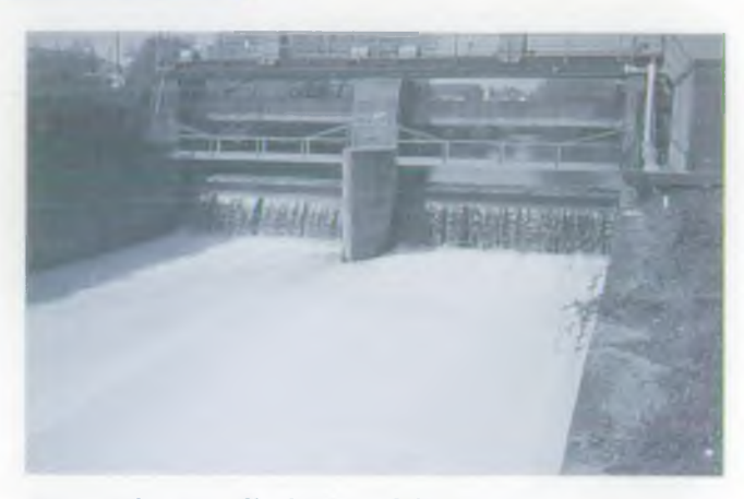
Werr at Ely papermill - barrier to fish migration

Coarse fish species, including roach, chub, dace and gudgeon are present from the paper mill weir in Cardiff to above Talbot Green. Roach populations have increased over the last 10 years. Coarse fish populations will be enhanced by stocking and habitat improvement. A reasonable trout fishery also exists