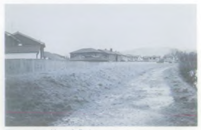
Houses at Ynysddu with flood protection

Within the Ely catchment, there has been pressure to develop on the flood plain, centred mainly around Pontyclun and Llantrisant. The NRA has, in many cases, objected to development and, in others, agreed mitigation works to alleviate flood risk. The NRA now requires surface water run-off from new developments to be restricted eg. by the provision of soakaways and porous pavements, particularly in the catchment area of the Afon Clun and other areas upstream of Miskin.