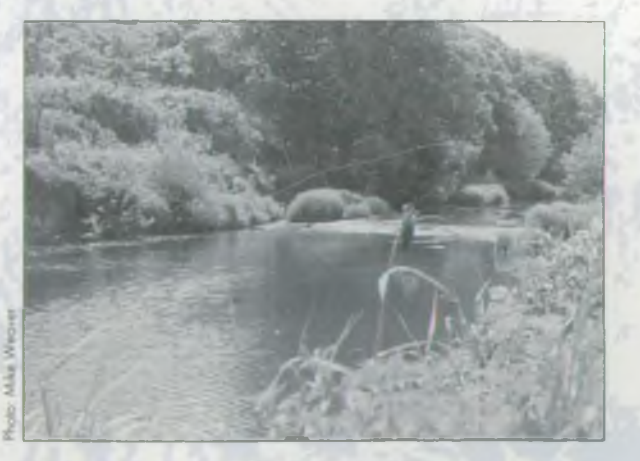
Trout fishing at Sheepwash

The Final Plan will be produced following the consultation and will, of course, have regard to the comments received.