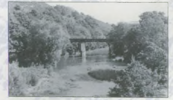
Recreation: Old Railway Viaduct, Great Torrington - now part of the Tarka Trail