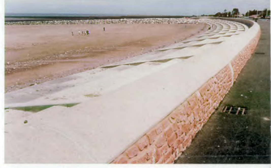
Completed sea wall at Minehead

The Committee has agreed a programme of strengthening bridges for which the Environment Agency is responsible. Work on some bigger road bridges has been done with the Highways Authority.