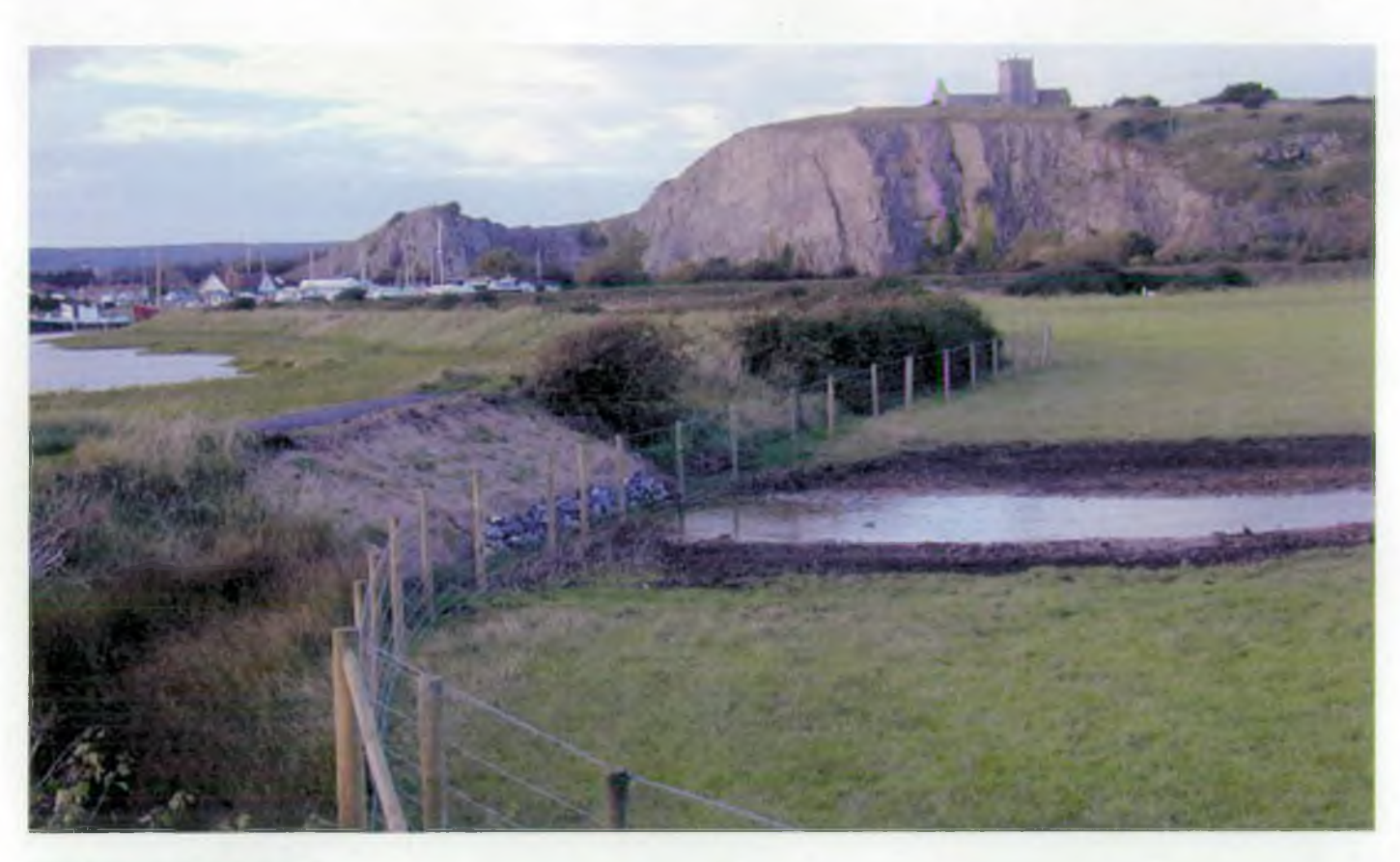
Uphill habitat enhancement works

Floods in 1994, 1997, 1998, 1999 and 2000 have shown that extreme weather is becoming more frequent. Climate change is becoming universally accepted but its impact is difficult to predict.