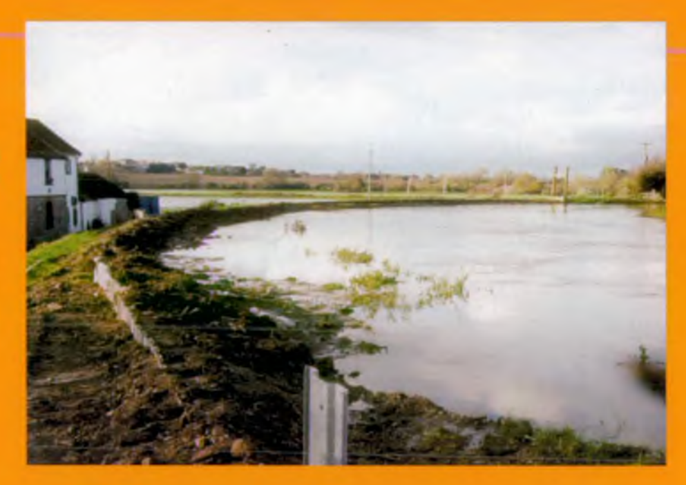
River Parrett bank strengthening at Stathe, 2000.

The Committee has done its best to regularly maintain its own defences so they work as well as possible.