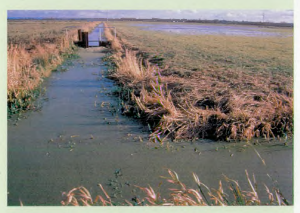
Raised water level area

Drainage boards evolved in the 19th century to remove flood water that spilled from the carriers to the moors. Then pumps started to replace gravity drainage from 1830.