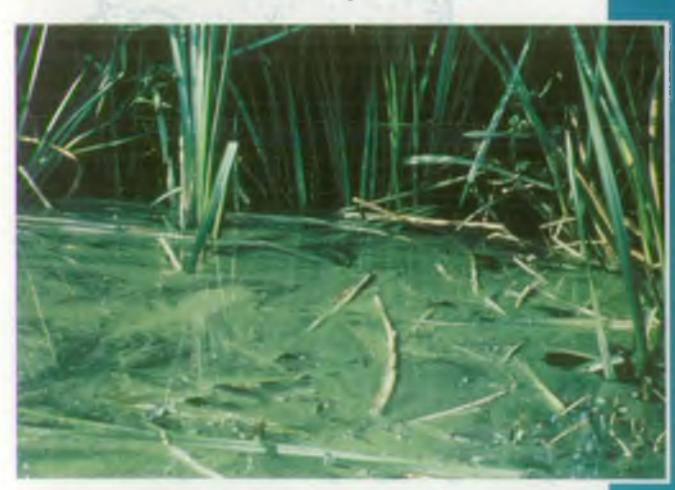
Freshwater blue-green algal scum

Other initiatives such as international agreements and national priorities are also resulting in action. Under the