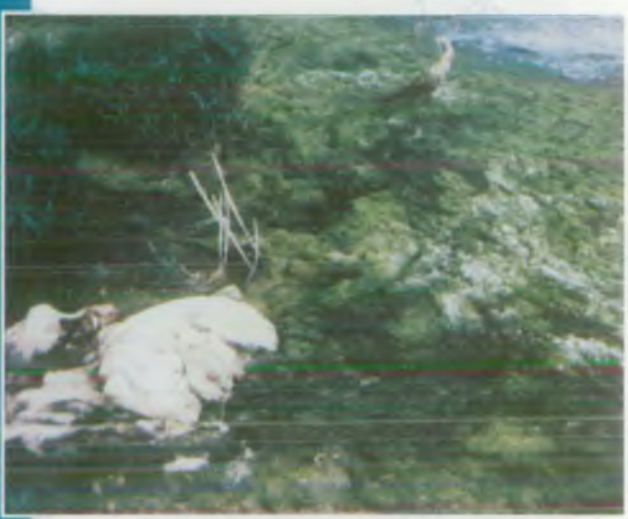
Shoreline accumulation of filamentous algae

At the national level, we intend to work with others to