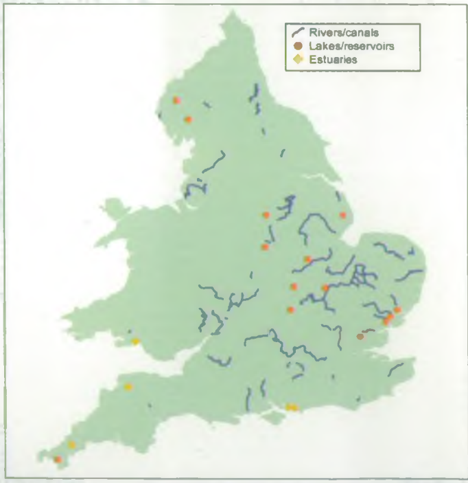
Figure 1. Sensitive Areas (Eutrophic) designated under the Urban Waste Water Treatment Directive in 1998

action in these areas. Under the UWWT Directive, nutrient reduction treatment is already in place at around 50 large sewage treatment works, and is required at a further 100 works by 2005. The Nitrate Directive focuses on reducing nitrate losses from agriculture through restricting the application of fertilisers and manure in areas draining to waters affected by nitrate