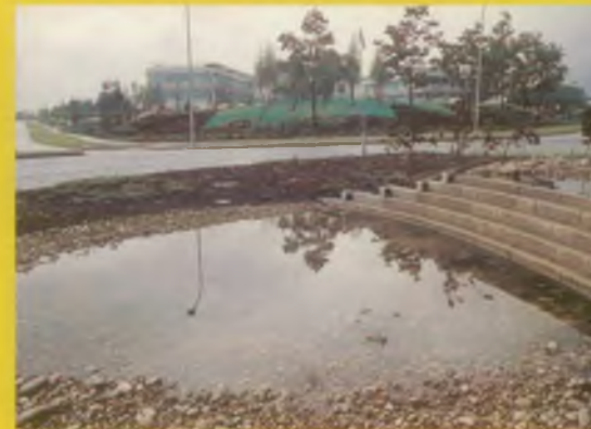
Blythe Valley Park, Solihull

This is a major office and leisure development in Solihull that discharges its surface water ultimately to the River Blythe, which is designated as a Site of Special Scientific Interest (SSSI). In its lower reaches there is also a major abstraction for public water supply which means there are restrictions on both the quantities of surface water allowed to be discharged to the river and requirements on the quality of that discharge. This means that a comprehensive drainage strategy had to be developed, involving balancing ponds and reedbeds connected by a series of swales.