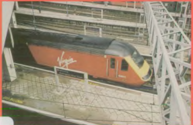
Birmingham New Street Station