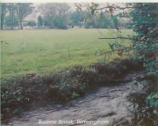
Bourne Brook, Birmingham

Both the Griffins Brook and Bourne Brook suffer the pressures of the heavily urbanised area through which they flow. Work on the Griffins Brook indicates that the quality problems are attributed to numerous wrong connections from domestic properties including sink, washing machine and toilet waste as well as intermittent discharges from industry, the majority of which have now been resolved. The final factor affecting the river was poor quality water being flushed out of the pools in the catchment, some of which are heavily populated with wild fowl. This summer, the University of Birmingham, on behalf of the Agency, is carrying out an intensive study on the pools to further increase our understanding of the effect of the pools on the river water quality.