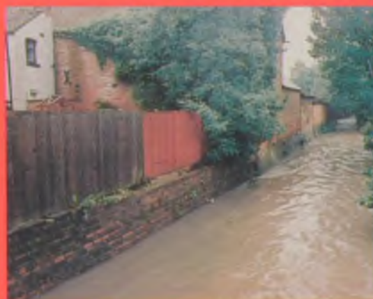
River Rea, Northfield

The main development area within the Tame area has been the installation of a river gauge within the MG Rover plant at Longbridge. This will provide early warning to the residents of Northfield who have suffered flooding four times in the past two years. The River Rea reacts quickly to rainfall which is of short duration and high intensity.