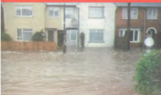
Flooding of Middlemore Road, Northfield