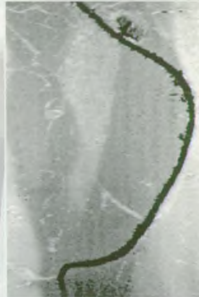
DEM generated from airborne SAR, Upton-upon-Severn area

Following further evaluation, operational techniques will be developed which, when implemented, will form part of a comprehensive flood management system to include flood event mapping and coastal defence monitoring.