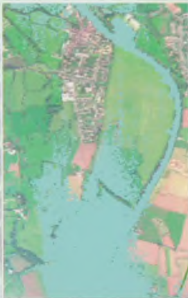
CASI image 'flooded' to 14 metres using height information from DEM