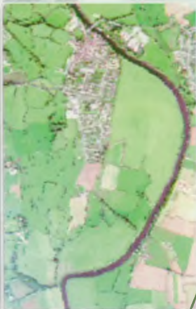
CASI image corresponding to SAR DEM area