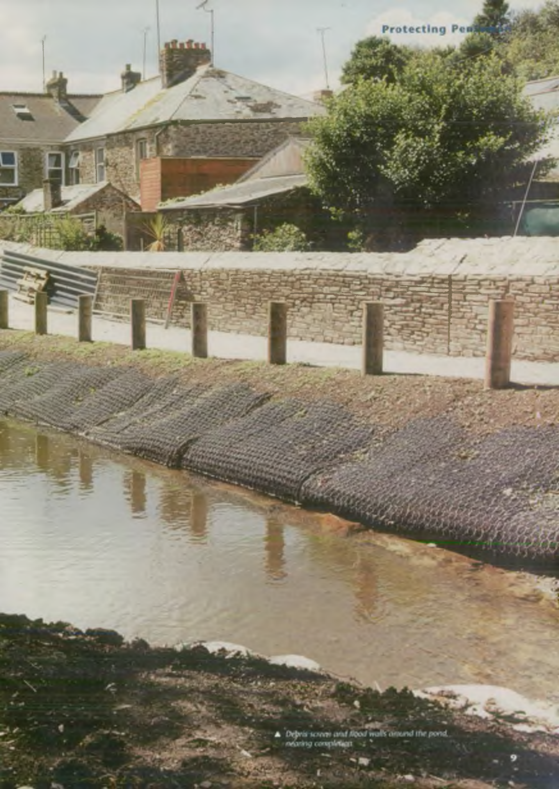
▲ Debris screen and flood walls around the pond, nearing completion