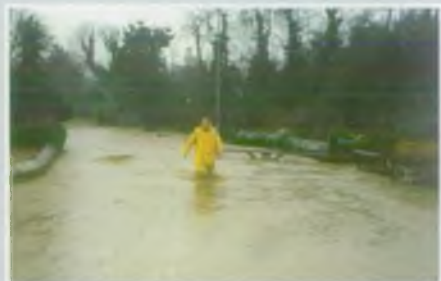
▲ 26 November 1997

The principal cause of the flooding was a small culvert running beneath houses in the Square. Debris washed downstream by floodwater also blocked the culvert, contributing to the flooding. Also, floodwater was unable to escape from the harbour as it is blocked off from the sea.