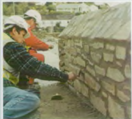
▲ Stone clad flood walls to keep the character of the village