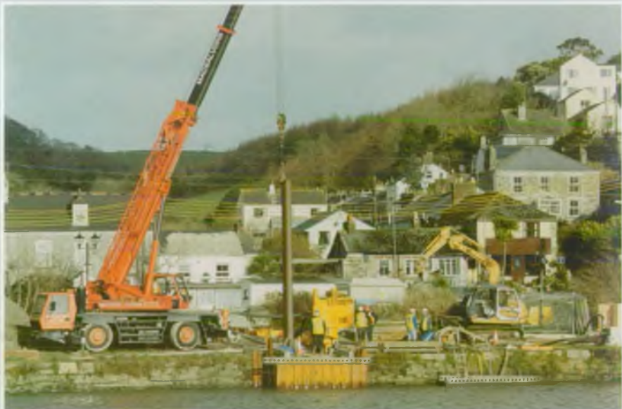
▲ Installing sheet piles where the culvert enters Pentewan Harbour

A public exhibition was held in the village in summer 1999 and the scheme gained the support of the majority of residents.