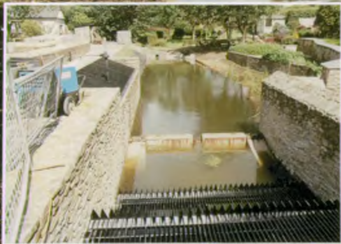
← Fish and eels can now pass the small weir that retains the pond