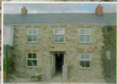
4 The almost completed cottage photographed six weeks after the original was demolished