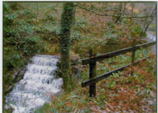
Hawkcombe Stream lower shingle trap