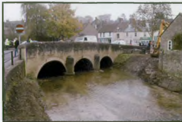
Church Bridge, Bruton