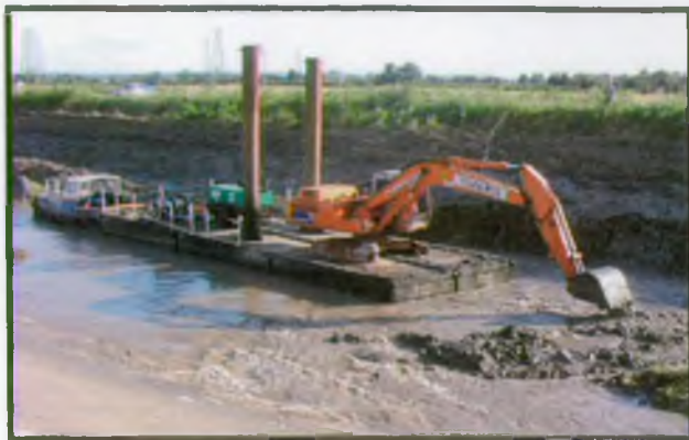
The Water Master dredging the River Parrett

Key Achievements in 2002 - Somerset area