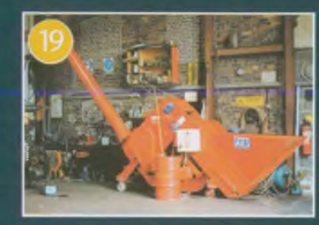
An aluminium can recycler

Tamworth Mile Oak Polesworth Sibson Bk A454 Atherstone Baddesley Barwell Ensor A446 A447 Hinckley 047 A47 Sketchley Bk Hartshill Nuneaton