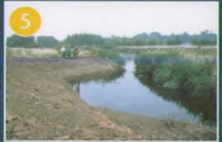
Fish refuge at Kingsbury on the River Tame

Tamworth Mile Oak Polesworth Sibson Bk A454 Atherstone Baddesley Barwell Ensor A446 A447 Hinckley 047 A47 Sketchley Bk Hartshill Nuneaton