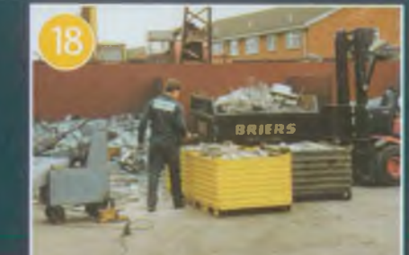
A Waste Transfer Station at Tamworth