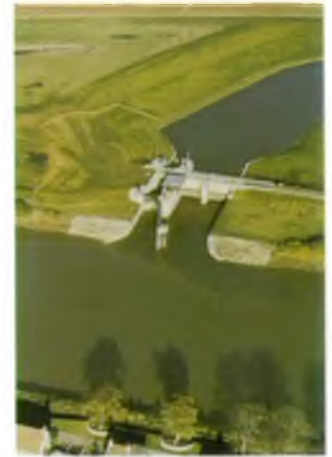
NRA YORKSHIRE REGION