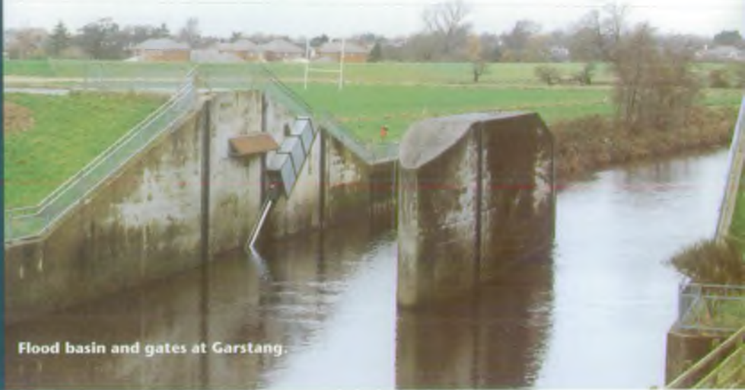
Flood basin and gates at Garstang.

As floods and droughts are natural forces we can't stop them, but we can help to lower the risks.