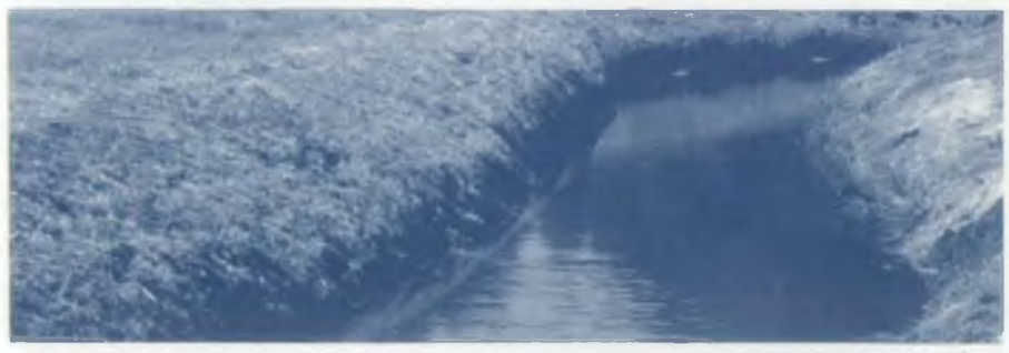
River bank degradation