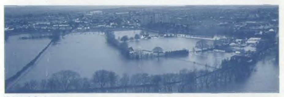
Worcester in flood