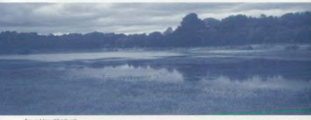
Brown Moss. Whitchurch

The Agency contributes to the management of air pollution through the Integrated Pollution Control (IPC) system. We have no regulatory control over air quality, the responsibility of which lies with local authorities.