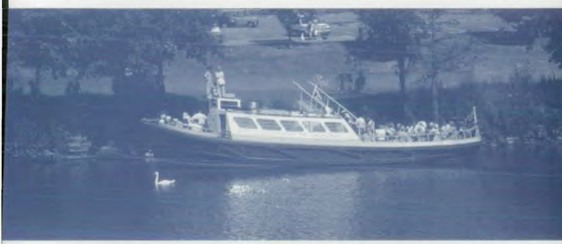
Pleasure boat at Worcester

Wetland areas such as the Strine levels are of archaeological interest as they retain environmental deposits and waterlogged objects are usually well preserved. Along the River Severn are the remains of historic fish weirs and eel traps.