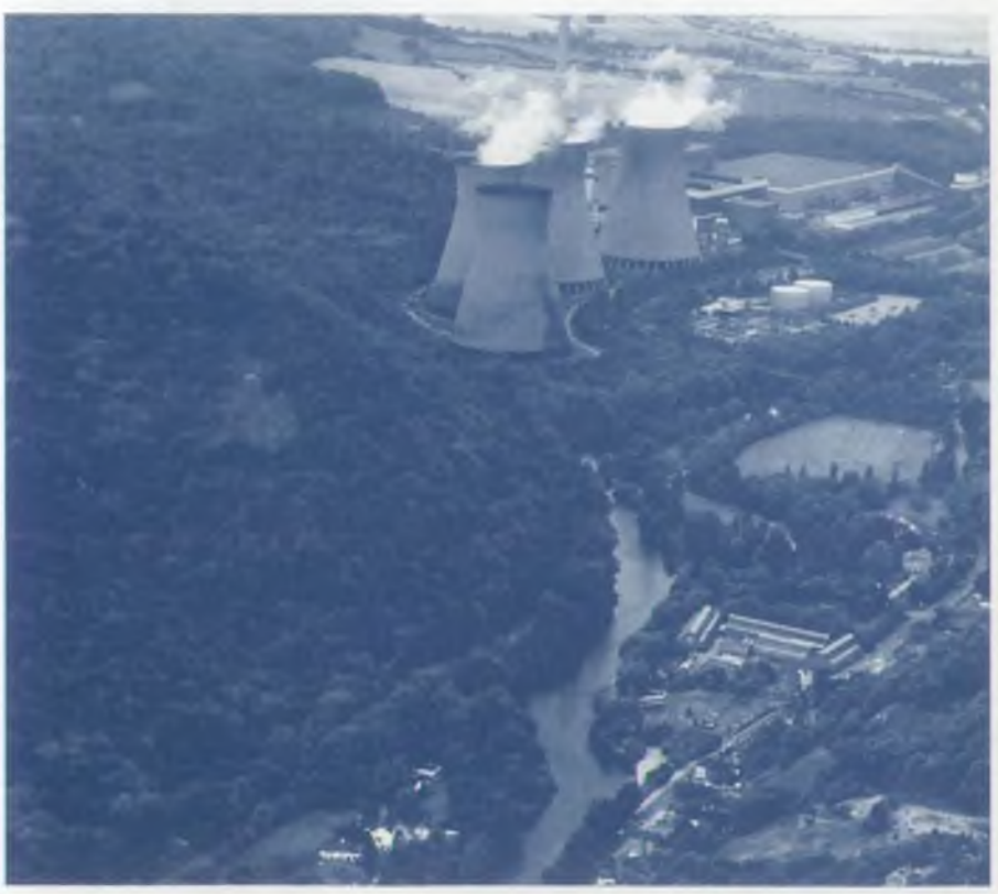
Ironbridge Power Station